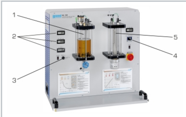
1 tank 1 for isothermic change of state, 2 digital displays, 3 switching between compression and expansion with 5/2-way valve, 4 heating controller, 5 tank 2 for isochoric change of state